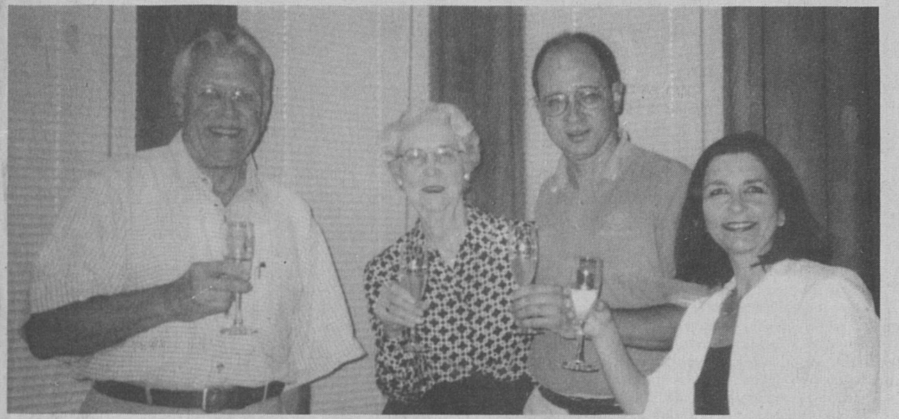
All the 'i's dotted and 't's crossed

Come show your spirit for what looks to be an exciting year at Rice!